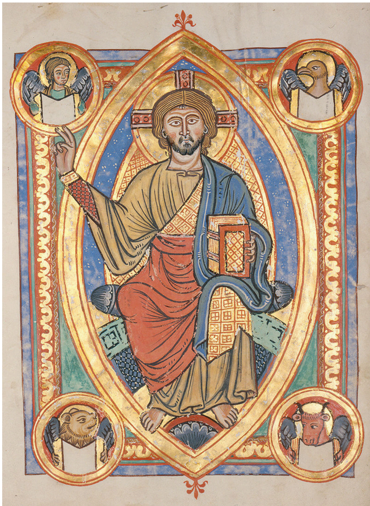
Christ in glory, The Bruchal Codex (1220), Speyer, Germany